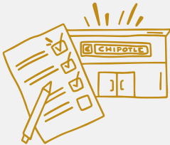
RESTAURANT INSPECTIONS P. 61